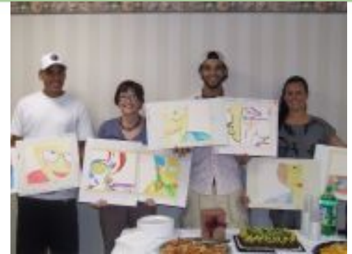
Students show a little sneak peak of the surprise art that the residents have been working so hard on. Pictures of the full exhibit will be in next month's edition.

As the Tennessee Wesleyan Servant Leadership project draws to an end, Morning Pointe threw a party to celebrate the art project's success. The residents have grown very close to these students over the past semester. We wish all of them the very best of luck in their future endeavors. We feel so blessed to have been a part of this special learning experience.