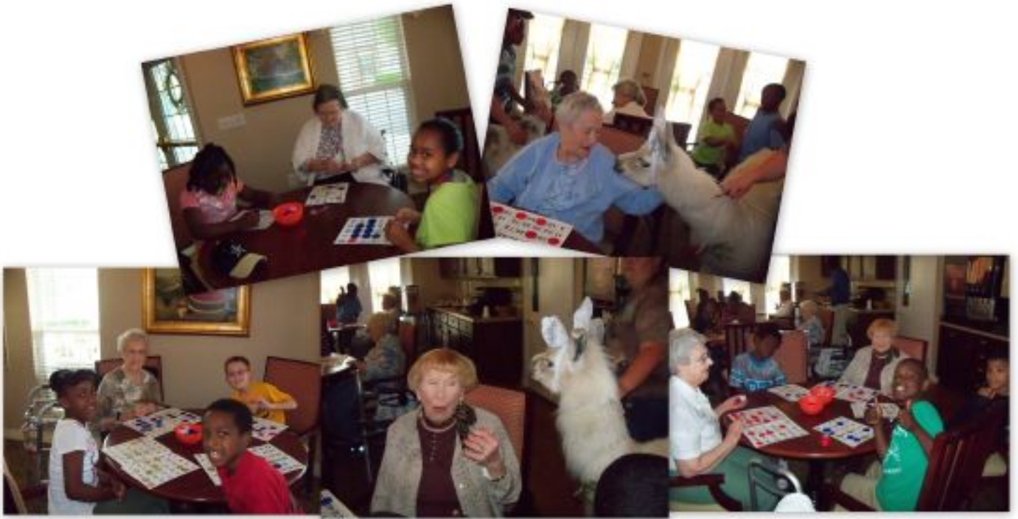
BINGO W/ BOYS AND GIRLS CLUB OF MAURY COUNTY AND ELVIS!