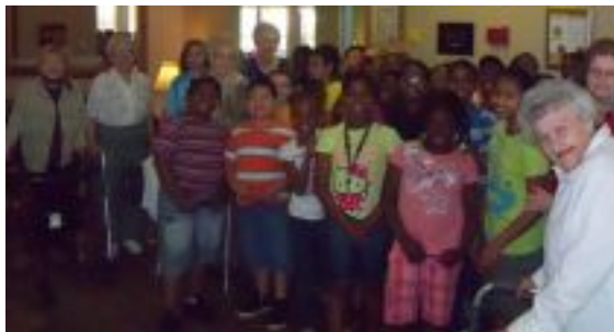
Residents with the Boys and Girls Club of Maury County. See more pictures on back page!

The residents at Morning Pointe in Columbia enjoyed an afternoon of BINGO with the Boys and Girls Club of Maury County.