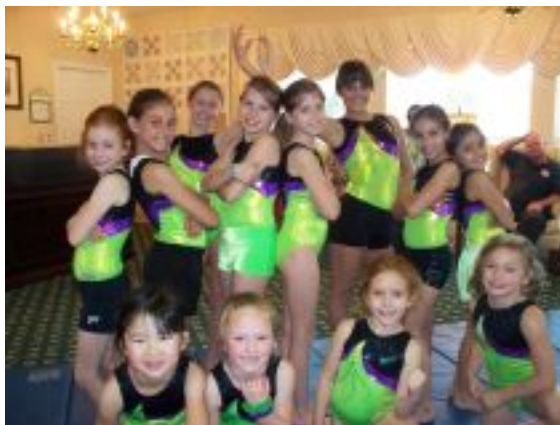
Tumble U gymnasts pose for the camera!

The Tumble U gymnastics team came to Morning Pointe one afternoon and demonstrated their unique skills. The young budding gymnasts performed handstands, back bends, and even a 'no-hands' cartwheel.