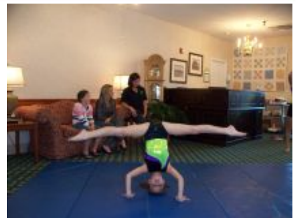
Wow! What balance.

Residents turned out for the lively demonstration. They loved watching the young girls and visiting with them afterwards. Thanks, Tumble U Gymnastics!