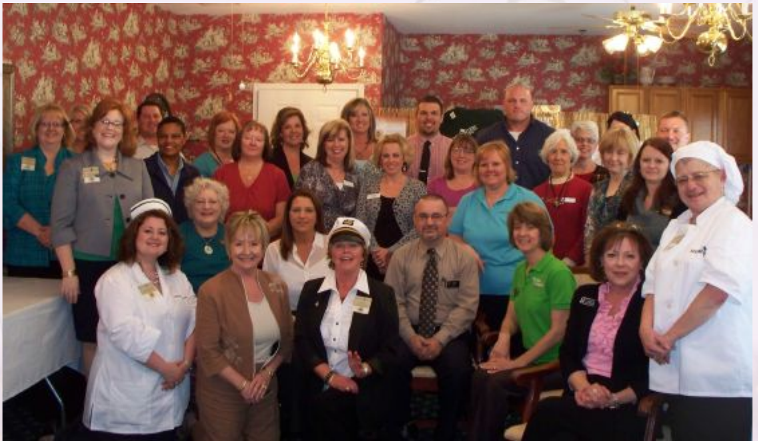
TEAM MORNING POINTE & COMMUNITY PARTICIPANTS OF TULLAHOMA'S CAREGIVER & SENIOR EXPO