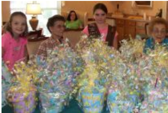
Brownie Troop 1267 and our residents made Easter baskets for Tullahoma Day Care.

The Easter holiday brought children from a nearby daycare, a local girl scout troop and a surprise visitor to Morning Pointe of Tullahoma.