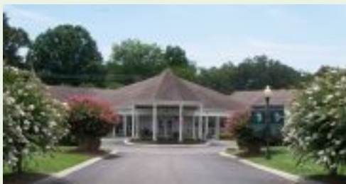
Morning Pointe Assisted Living and Memory Care Residence of Tullahoma