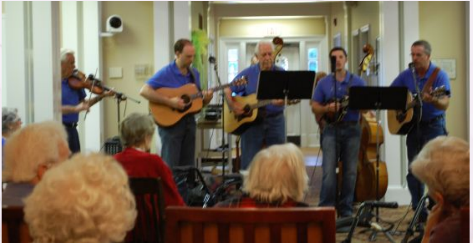
CARROLL CREEK BLUEGRASS BAND