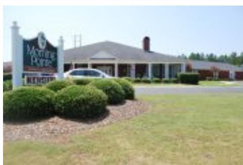
Morning Pointe of Tuscaloosa